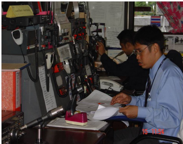
Transport Safety Center